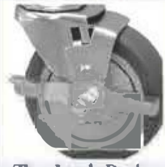
Top Lock Brake (T)