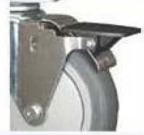
Tech Lock Pedal Brake (H)